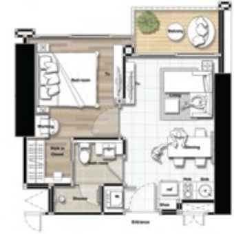
TYPE A 41 SQ.M.