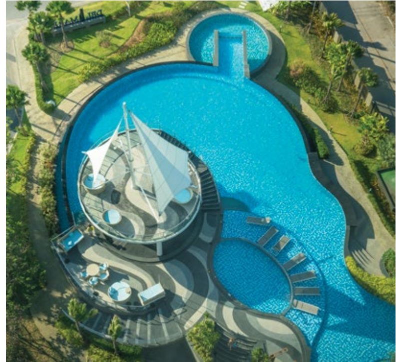
*PHOTOGRAPHY ON BROCHURE CONSISTS OF PHOTOGRAPHY ON LOCATION